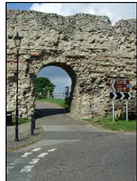
Pevensey Castle English Heritage