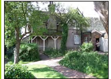
Pevensey Castle Cottage Tearooms

Cottage Tea Rooms Tea Rooms & Garden Pevensey Castle Drinks & snacks